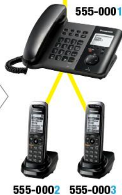
3 Users: 3 DID